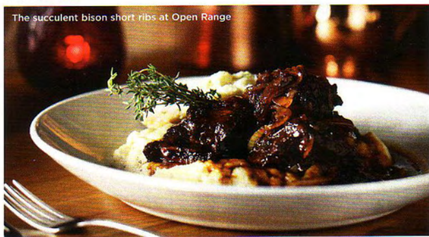
The succulent bison short ribs at Open Range